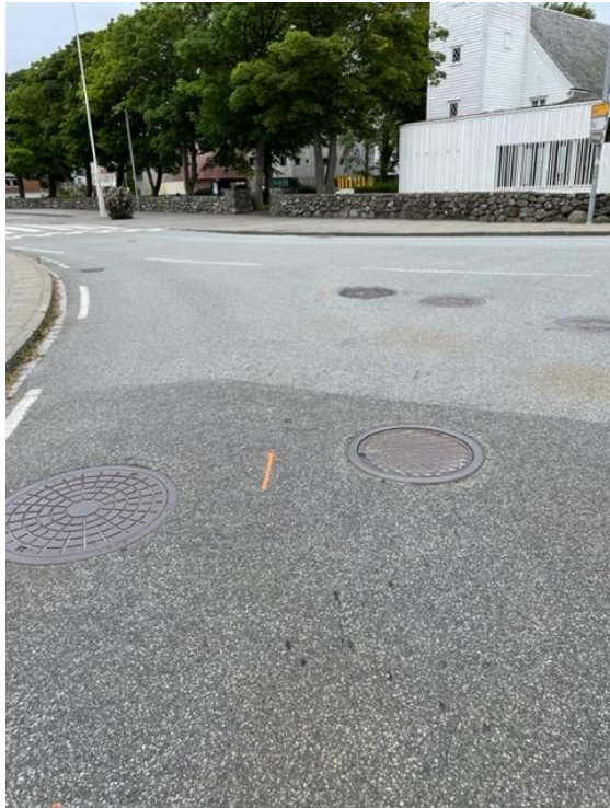
Right lane first 130 m – from picture A ...