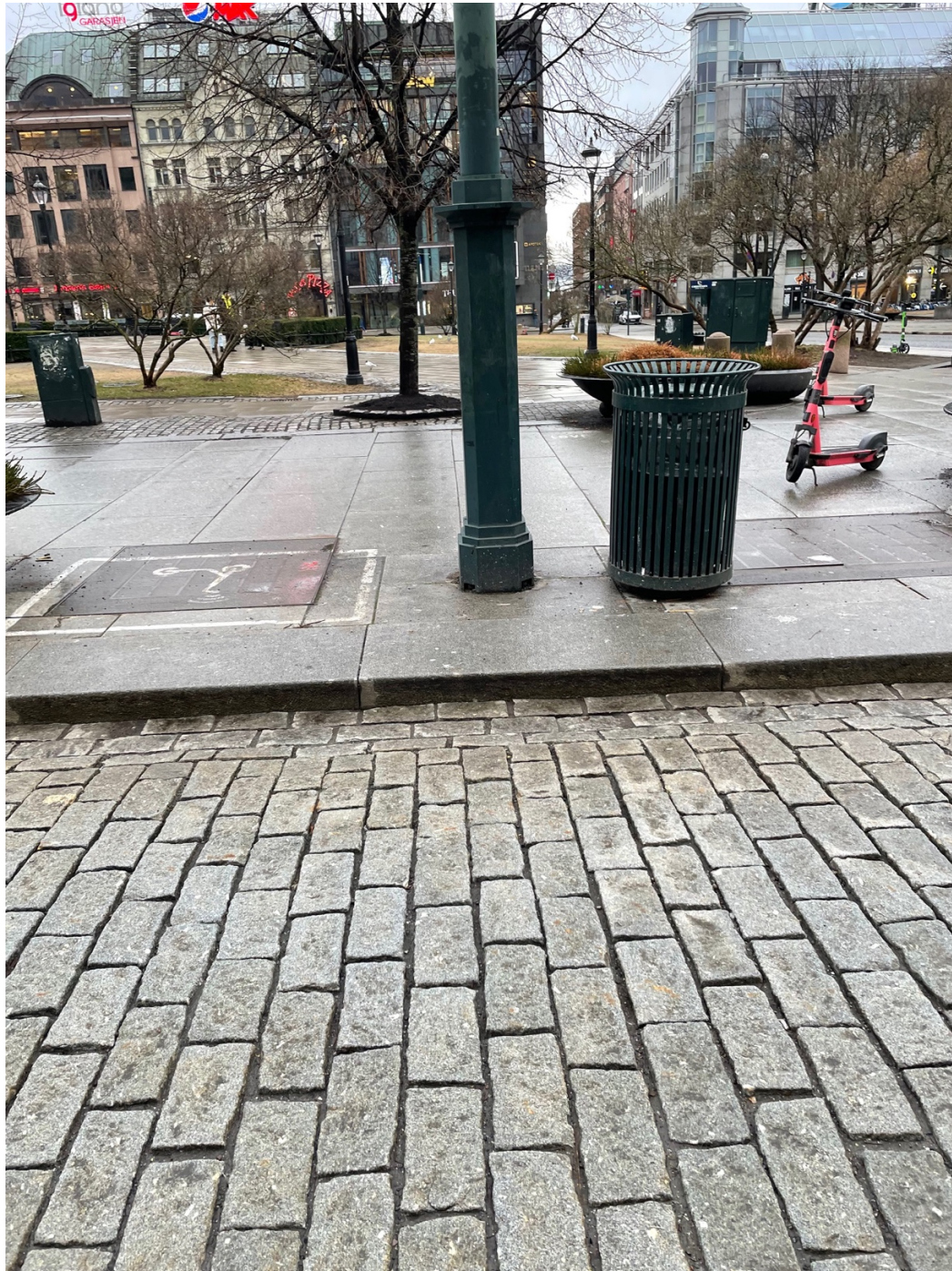
The lamp post at Rosenkrantz' gate.

Karl Johans gate, 59,8m before lamp post before Rosenkrantz' gate.